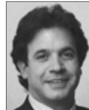
Dr. Rudy Tanzi