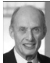
Dr. Paul Greengard